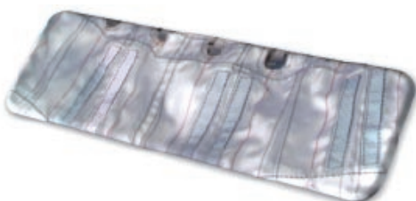
Alternative Para Drogues replace Beta Lights Para Drogues