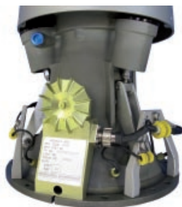
Brushless Air Driven Generator (ADG) with machined Turbine Impellor