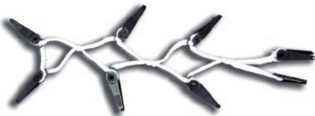
Replaceable intercostal nets