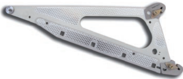
Easily replaceable ribs with larger reflective areas