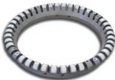
Billet machined attachment rings