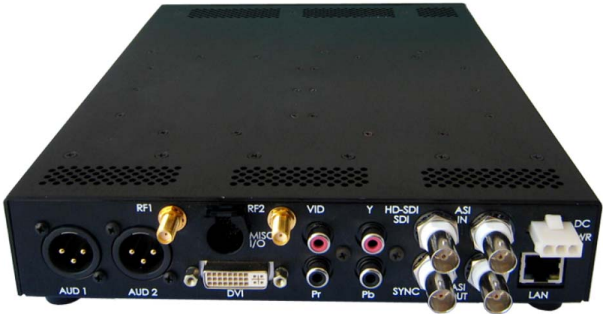
MVRD Rear Panel