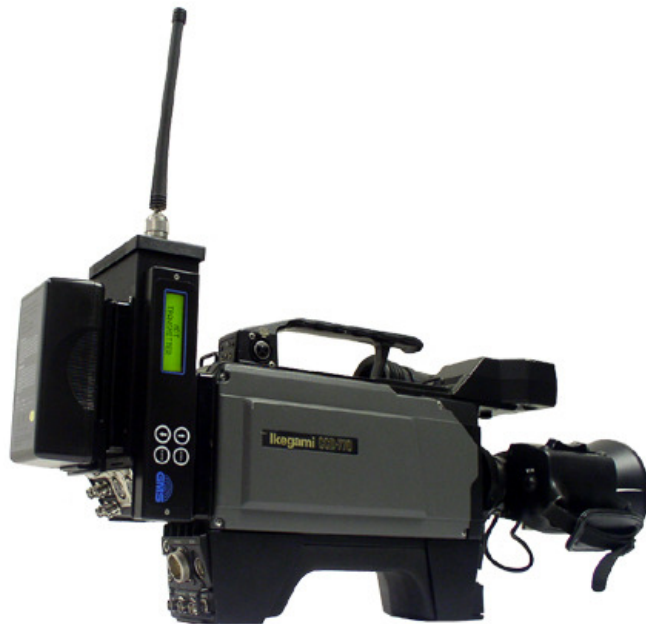
MDT Broadcast with IDX Battery