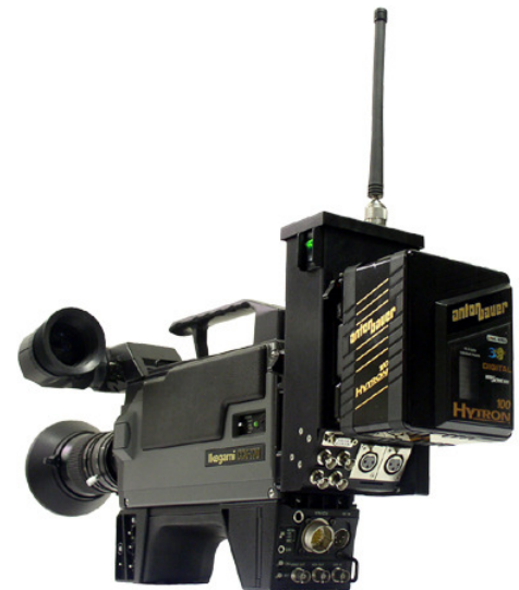
MDT Broadcast with Anton Bauer Battery

The Messenger Camera Enclosures (MCEs) are a series of optional in-line camera mount boxes for either the MDT or the MDT-B transmitter, which mounts to professional camera via the battery interface. The housings are designed to use either Anton Bauer or IDX batteries.