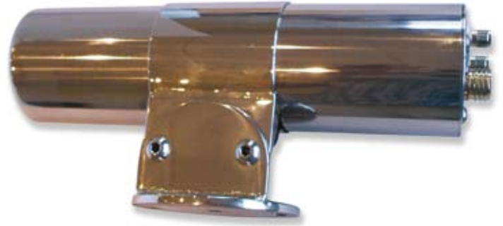
IP67 SeaVue Housing

The SeaVue system will benefit any user during the security of boarding operations, SAR, survey and general patrol duties where real-time information can make the difference to operational safety and capability.