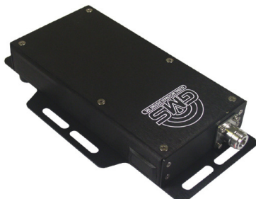
Down Converter in optional enclosure

GMS' 1.70 – 1.85 GHz "Block Down-Converter Card" (BDCC) was designed as a first down-conversion stage for the Messenger Smart Receiver (MSR). It was designed to support C-OFDM, however, it can be used with a wide variety of analog and digital modulation schemes! It features a high compression level, high-level AGC, programmable IF amplifier, high-linearity, wide spurious-free dynamic range, and low-phase noise. The High-Level AGC system is designed to reduce overload when the input signal approaches the input compression point. For an 8 MHz DVB-T signal, the maximum dynamic range is > 70 dB!