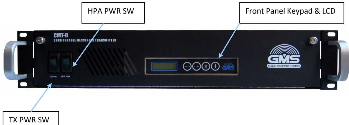
FIGURE 4 – CMT-R FRONT PANEL