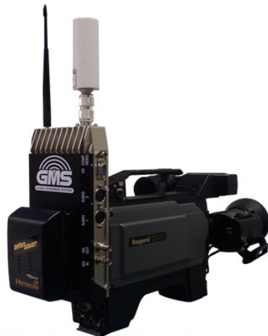
CMT with Anton Bauer Battery